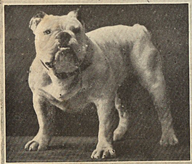
THE BULLDOG, SOUVENIR.